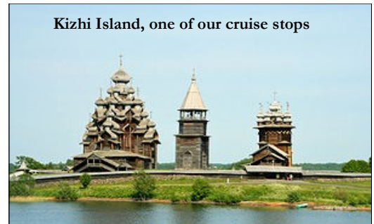
Kizhi Island, one of our cruise stops