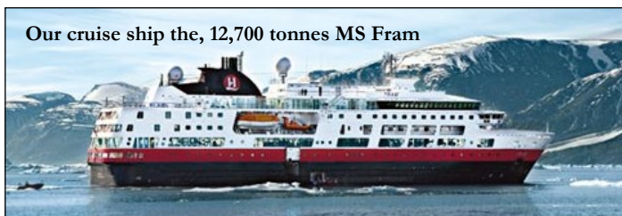
Our cruise ship the, 12,700 tonnes MS Fram

choosing our departure date. February is usually the best month to visit Antarctica as it is toward the end of summer there, when the whale watching is at its peak. Also the adult penguins are ashore molting and their chicks are beginning to fledge. Another bonus is that the volume of water flowing over the Iguazu Falls (For those planning to take the Patagonia extension) peaks from December through March. These falls are higher than Niagara and twice as wide.