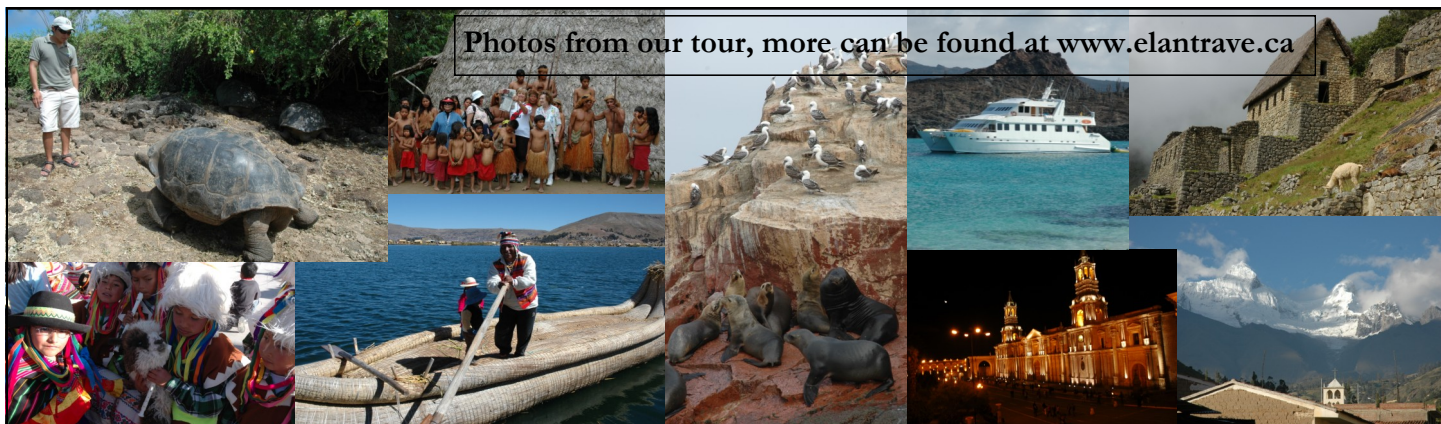
Photos from our tour, more can be found at www.elantrave.ca

I have left details of our Peru/Galapagos tour on our website, www.elantravel.ca . Please let me know if you are interested.