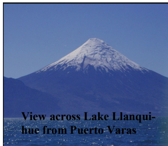
View across Lake Llanquihue from Puerto Varas