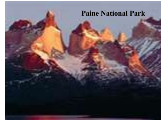
Paine National Park

You are advised to contact your Doctor or Public Health authority regarding inoculations, medications etc. Some walking is involved when visiting scheduled sites and parks, a certain degree of fitness is required. Please plan your luggage to your ability to carry it at times. Those with disabilities are welcome but must provide their own companion as there is no provision for individuals who require ongoing assistance.