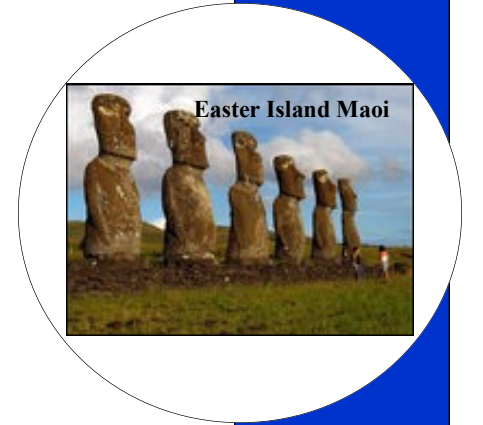
Easter Island Moai

Argentina, Chile & Patagonia Featuring: Buenos Aires, Glacier National Park, Bariloche, Santiago & a deluxe 3 night Cape Horn Cruise January 13 2012, 18 days Can. $9,811.00 4 day Easter Island extension $1,933.00