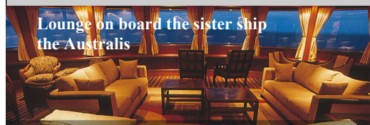
Lounge on board the sister ship the Australis